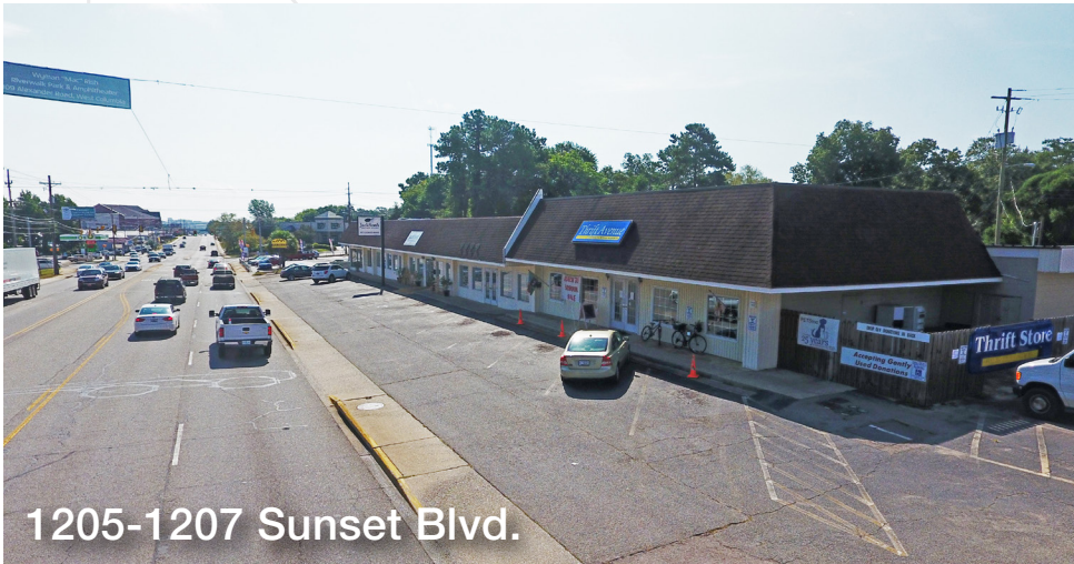
1205-1207 Sunset Blvd.