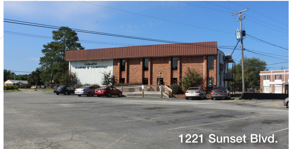
1221 Sunset Blvd.